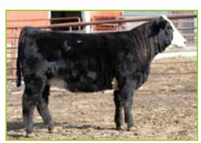
LOT 55A: 560M