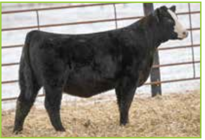
LOT 54A: 187