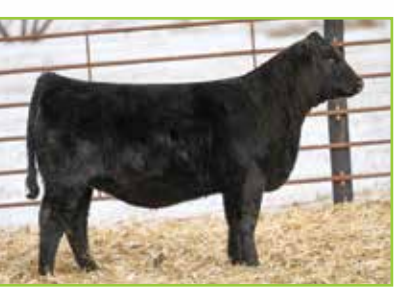
LOT 51B: 183