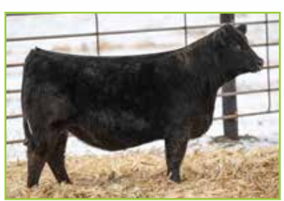
LOT 52C: 873