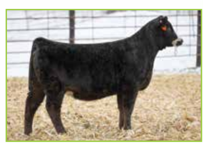
LOT 54B: 815