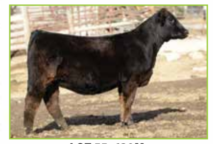
LOT 55: 630M