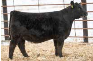
LOT 52B: 615