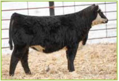
LOT 54: 27