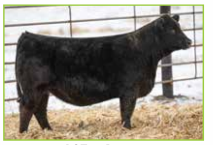
LOT 52A: 553