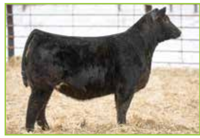
LOT 53B: 424