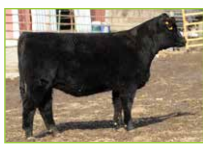
LOT 55B: 606M