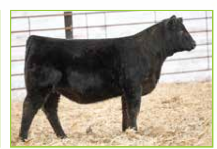
LOT 52: 220