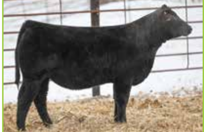
LOT 53A: 45